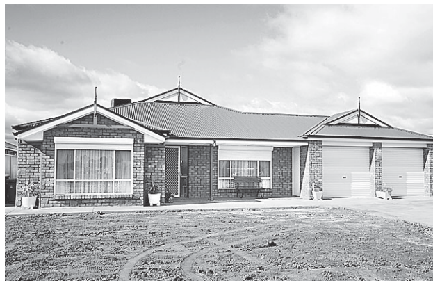
Clockwise from left The kitchen is within easy access of the entertaining areas; finials add interest to the facade; the lounge catches the afternoon sun so it is a lovely spot to sit during winter.