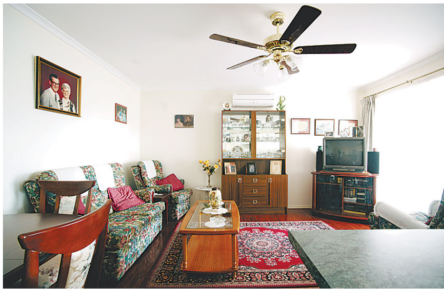
Mix and match Choose pavers that complement the brickwork of your home for a consistent style, top; Peggy's flat includes an open-plan kitchen, meals and living area, above.