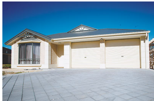
Clockwise from top The lounge provides a second living area; the Sienna fits comfortably on a compact block; Crystal McBearty and Gregg Mewett moved from a small unit into their home.