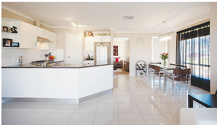
Entertaining zone Enjoy an intimate dinner for two, above, or cater for a crowd by sliding open the double glass doors of the family room and spilling outside onto the alfresco area, below.